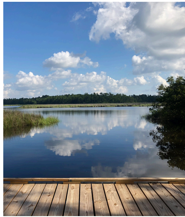
View from the kayak launch.