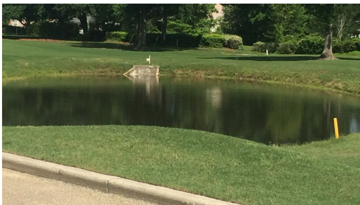
Figure 12. A golf course pond lacks adequate buffers around its edge. Also, the course used improper mowing practices to the pond edge.

At minimum, this part of the plan should include a description of the land including an official survey map completed by a licensed surveyor. Additional maps focused on the property itself may be necessary depending on the resource concerns affecting the golf course. Aerial photographs should also be included, if possible. This section is also a good place to record the management history of the property to aid in future decision-making.