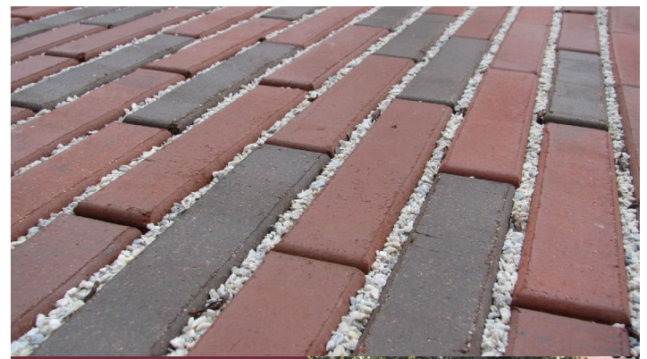
Figure 5 and 5-1. Maximize the use of pervious pavements. Grass is usually only suitable in between pavers when a soil is engineered to retain nutrients and appropriate moisture. The use of “grass-crete” is not recommended for high-traffic areas without irrigation and proper maintenance.

Neat Fact: The critical transitional area around the basin is called the littoral shelf. The shelf should gradually slope unevenly into the basin and contain multiple plant species to promote biodiversity. The shelf should account for approximately 30 percent of the land area of the basin.