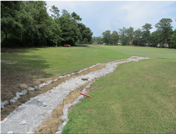
Figure 9. This bioswale was implemented to improve water quality on a golf course in south Mississippi.