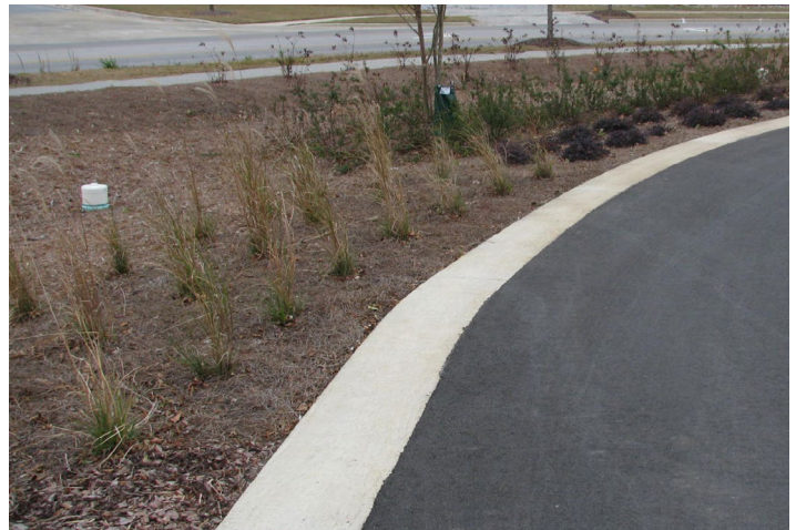
Figure 2. This bioswale slows the progress of water entering a stream. The white PVC cap is a “bubble-up” emitting water from upslope storm sewers, detention basins, and roof gutters.

Cons: Though most bioswales are beneficial for infiltration, only fully vegetated trapezoidal bioswales provide the full benefits of bioremediation.