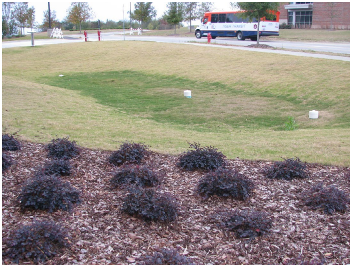
Figure 4. This detention basin holds water temporarily and allows sediment and excess nutrients a chance to settle out or be remediated/removed before water flows into a bioswale below it (Figure 2). The white caps are “bubble-ups” from storm sewers draining the roadway. The exit point is not visible but is a grated floor drain into a schedule 3034 (green PVC) 8-inch pipe.

Neat Fact: Typically, storm drains from impervious surfaces are routed directly to a detention basin. Since the 100-year storm can produce a significant volume, outlets into the basin tend to be structural with entrance spillways and debris drop vaults that collect landscape debris.