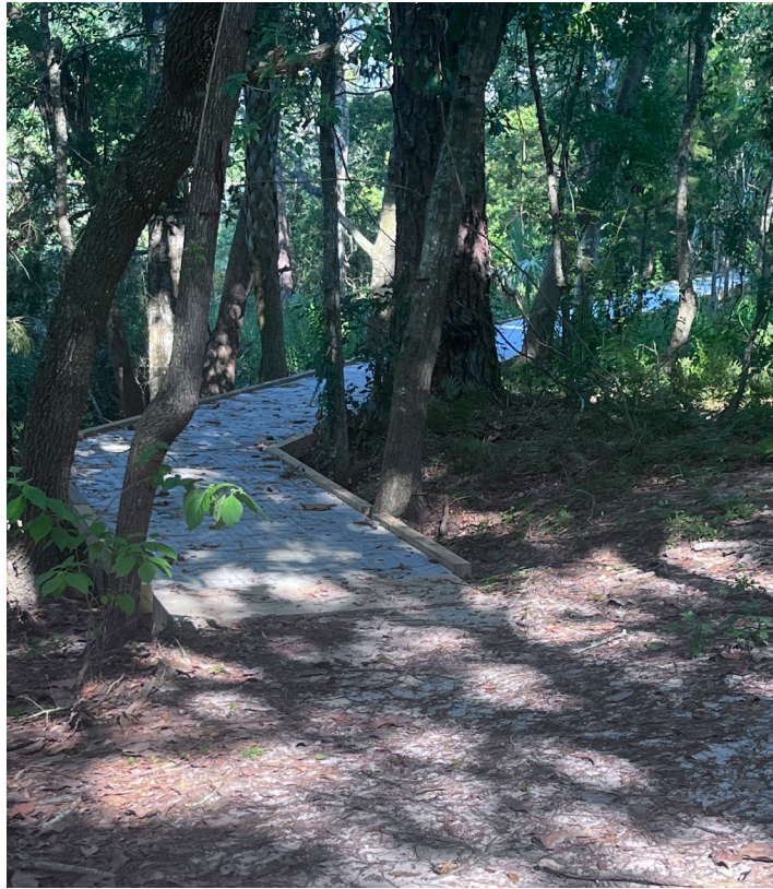
Marker #2. The West Entrance. An on-grade trail leads users to the 500' boardwalk and overlook.