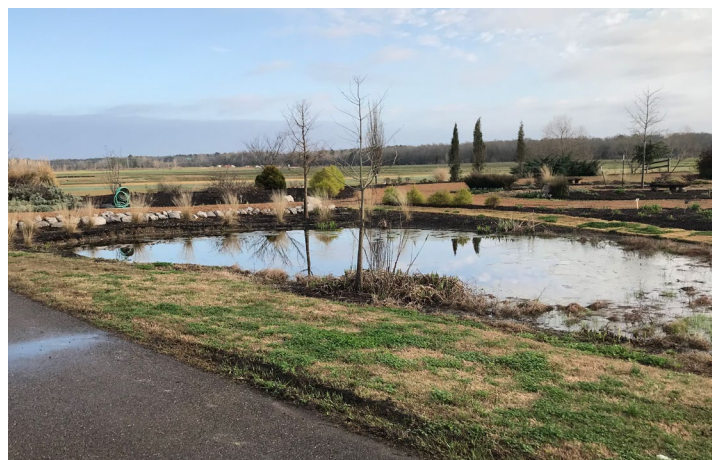
Figure 14. This parking surface drains into a rain garden with unamended soils.

After collection of baseline water-quality data, sampling should be planned for after construction is finished. Postconstruction surface-water-quality sampling should begin following the installation and maintenance of golf-course turf and landscaping. Once construction is complete, periodic water sampling is recommended. Periodic sampling could range from monthly to three or four times a year, depending on budget, time, and labor constraints. Periodic sampling should be conducted at consistent time intervals and should consider seasonal fluctuations in landscape management (fertilizer and pesticide applications) and rainfall. Should there be no discharge on the scheduled sample date, samples should be taken during the next discharge event. Postconstruction surface-water-quality sampling should continue through the first 3–5 years of operation. Due to annual fluctuations in climate and rainfall in Mississippi and Louisiana, it is recommended that annual sampling during wet and dry seasons continue voluntarily, even if all water-quality standards are met in the initial 5-year period. It may also be wise to sample if a significant change has been made in course operation or design that could affect nearby water quality. Ongoing, routine water sampling provides meaningful trends over time.