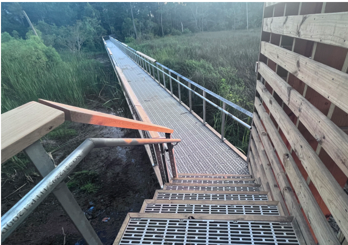
The long span over the marsh affords a 360° view.