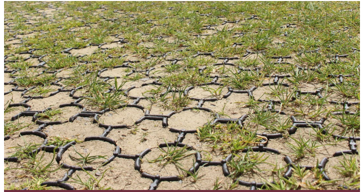
Figure 6. This parking lot has a grid with soil infill. Over time, this surface will become compacted and may decrease in permeability.

Captured rainwater can help supplement irrigation needs of a golf course through the process of water harvesting. Backup sources may be needed during drought conditions or when impounded waters are not of high enough quality for use on the course. The reuse of captured stormwater for irrigation is desirable when water quality is poor to conserve potable sources, maintain hydrologic balance, and provide better water treatment.