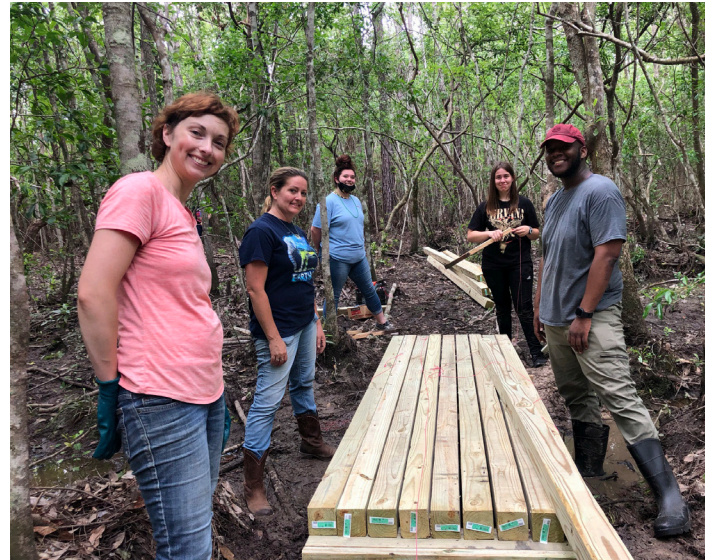
GCCDS works with student groups to install trail markers and build a 70' boardwalk that will ensure trail access from the St. Martin High School Entrance.