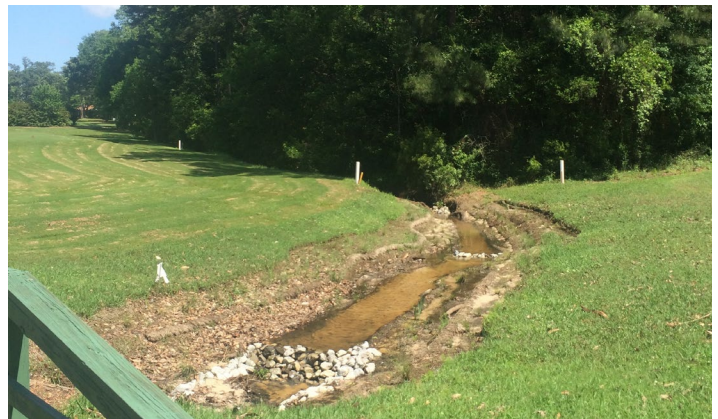
Figure 7. This three-tiered weir system within a two-stage ditch is implemented in a drainage channel within a golf course in south Mississippi.