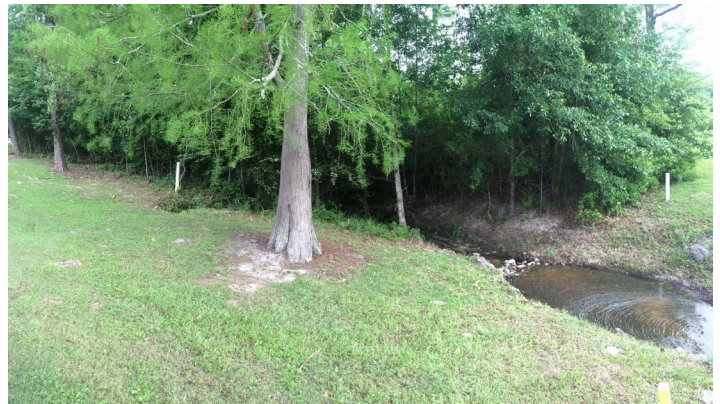
Figure 13. In this drainage area on a golf course in south Mississippi, natural vegetation was allowed to grow to provide benefits for water quality.