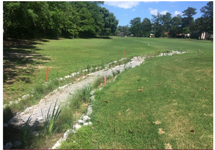
Figure 10. This is the same bioswale pictured in Figure 9 after grass plantings to provide a buffer for improving water quality.

In order to determine whether an area meets this definition, a professional would look for these criteria: