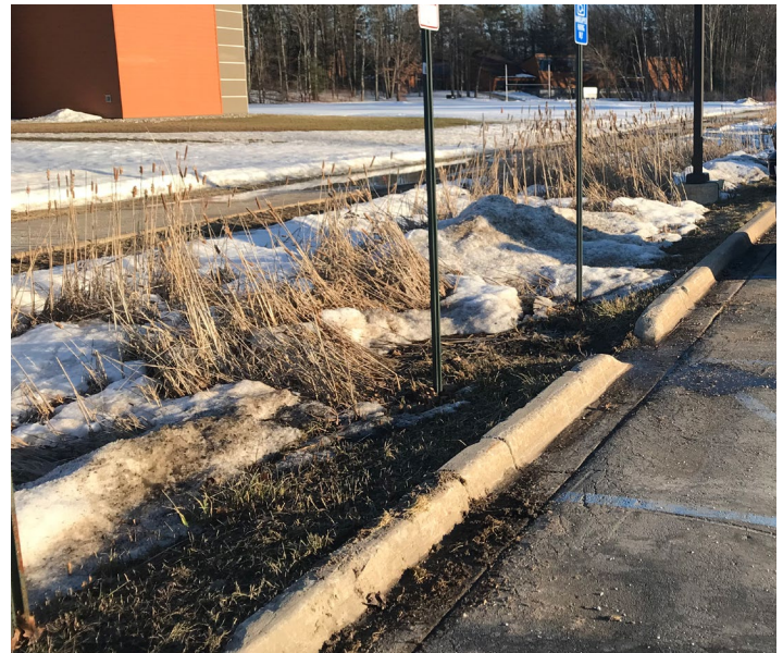
Figure 3. Use depressed landscape islands in parking lots to catch, filter, and allow water to infiltrate, instead of elevated curbs that direct water into storm drains.

Neat Fact: Rain gardens fit into this category, but they may not always have drainage systems or engineered soils.