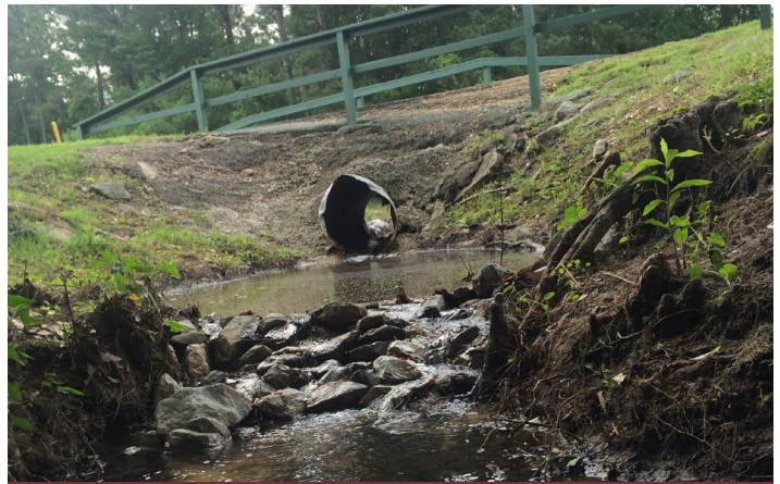
Figure 8. This low-grade weir or check dam on a golf course in south Mississippi improves water quality by increasing hydraulic residence time of flowing water, allowing additional time for sediment to settle out of the water column and pollutant removal by natural processes.

Section 401 of the CWA requires that any person applying for a federal permit or license, which may result in a discharge of pollutants into WOTUS, must obtain a state water-quality certification that the activity complies with all applicable water quality standards, limitations, and restrictions. No license or permit may be issued by a federal agency until certification required by section 401 has been granted. Further, no license or permit may be issued if certification has been denied. Including this 401 certification step allows states and tribes to take a more active role in decisions impacting aquatic resources for better consideration of local concerns in the federal permitting process. In most cases, Section 401 certification review is conducted at the same time as the federal agency review for a Section 404 permit. More information about Section 401 permitting can be found at https://www.epa.gov/cwa-404/clean-water-act-section-401-certification .